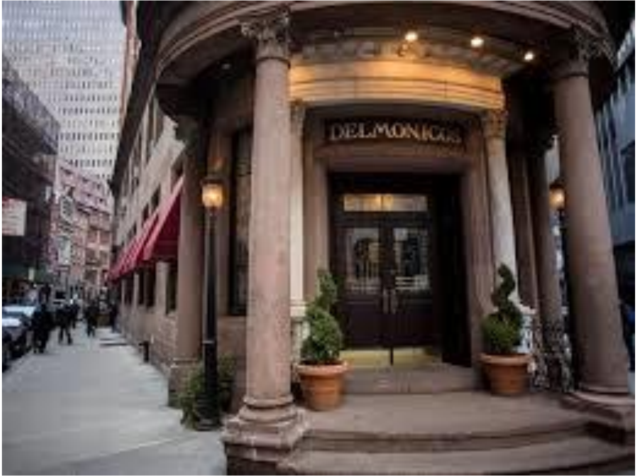
Delmonicos French steakhouse restaurant --- est. 1829 on Wall Street NYC