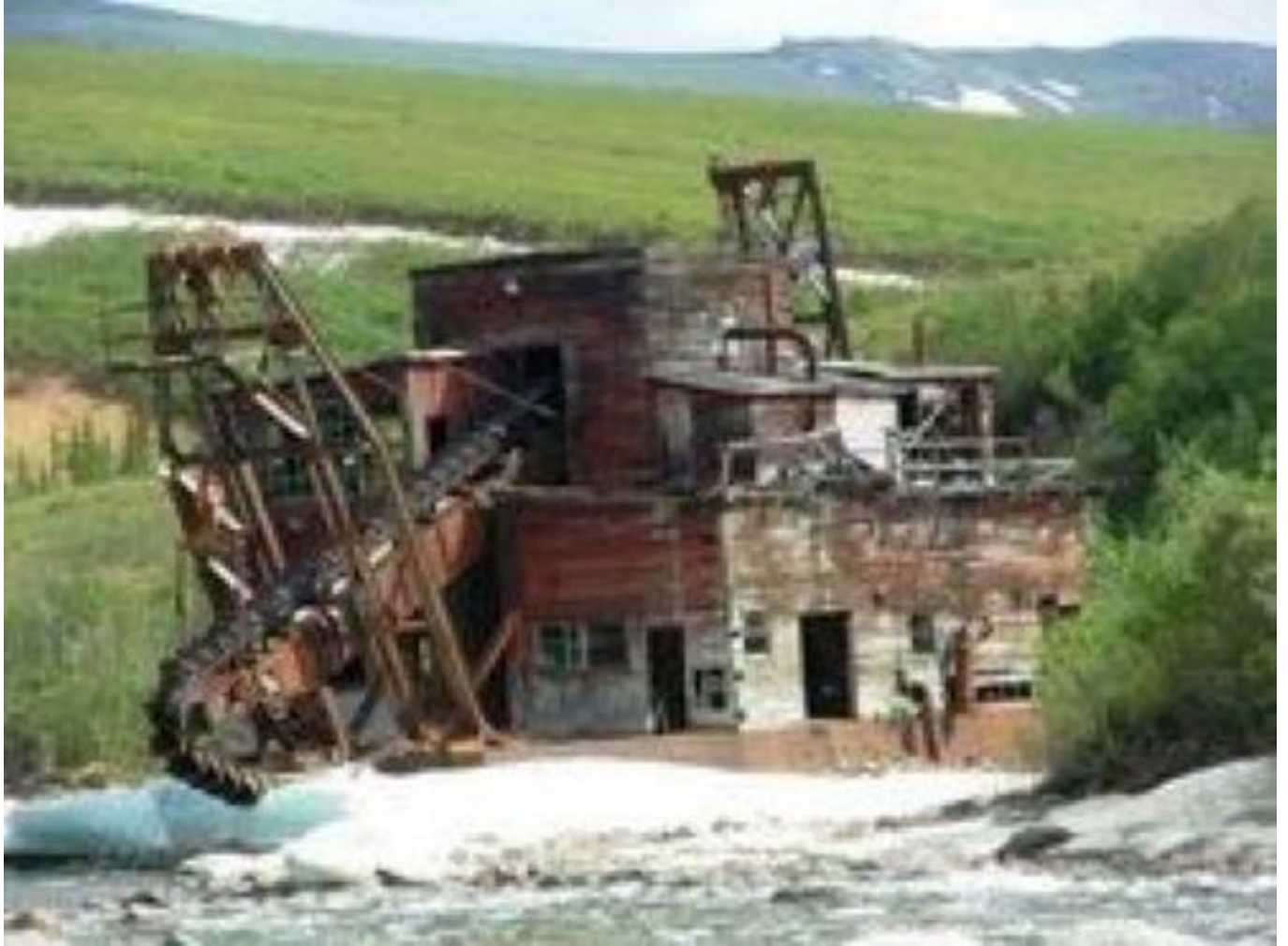
Boldrin Creek mining dredge --- Abandoned in nearby Klery Creek, AK since 1949